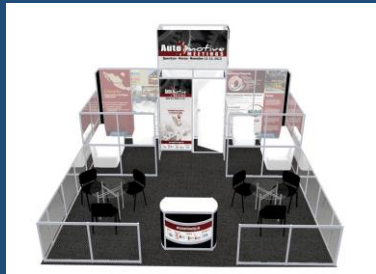
This picture is subject to modifications

This package is an actual partnership that would guarantee your company a high profiled participation. Only 2 companies will be granted it.